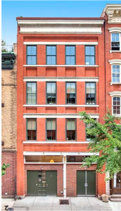
Halstead.com WEB# 18923067