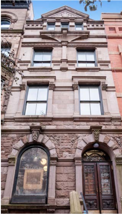
Halstead.com WEB# 19272215

Generally 59th to 110th Street, Hudson River to West of Fifth Avenue