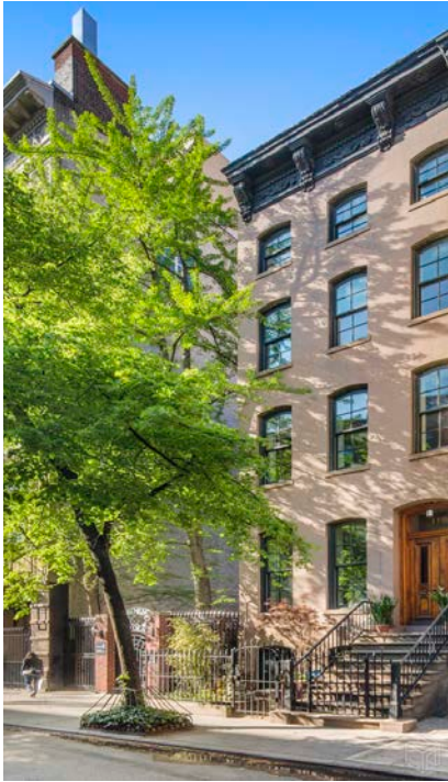
Halstead.com WEB# 18150133