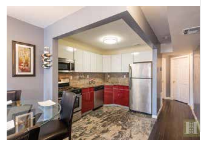
halstead.com WEB# 13355799