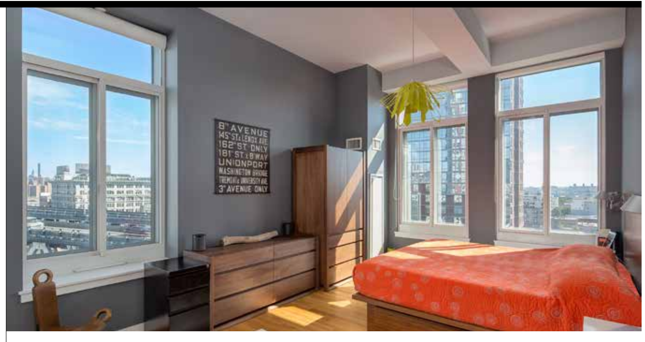
halstead.com WEB# 13272885