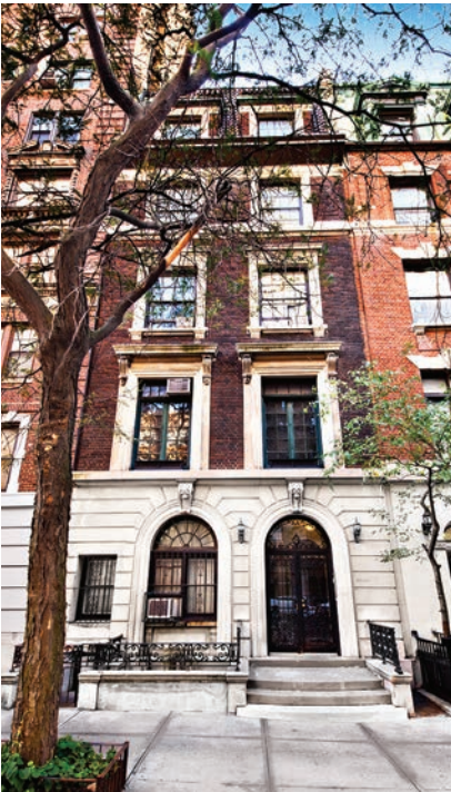
Halstead.com WEB# 15274528

Generally 59th to 110th Street, Hudson River to West of Fifth Avenue