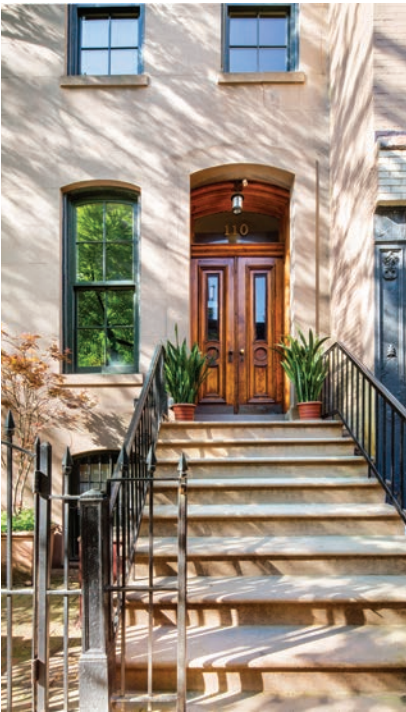
Halstead.com WEB# 18150133