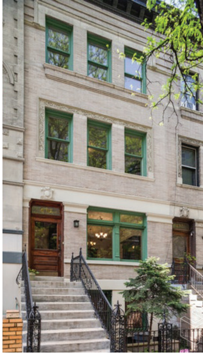
Halstead.com WEB# 18502679

Generally North of 96th Street on the East Side, and 110th Street on the West Side