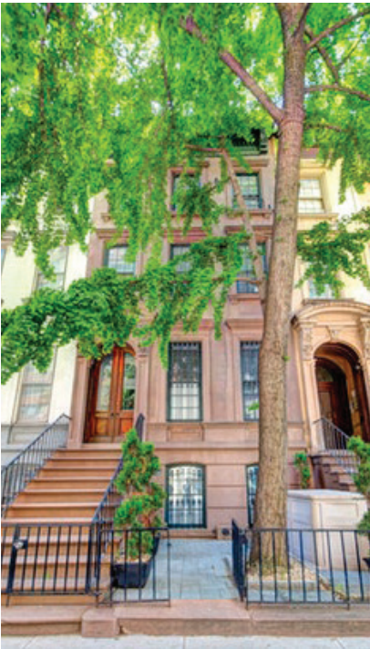
Halstead.com WEB# 17000068