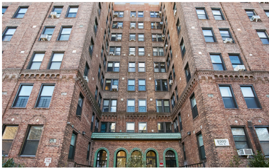
halstead.com WEB# 20080051

There were 17% fewer closings than the first quarter of 2019.