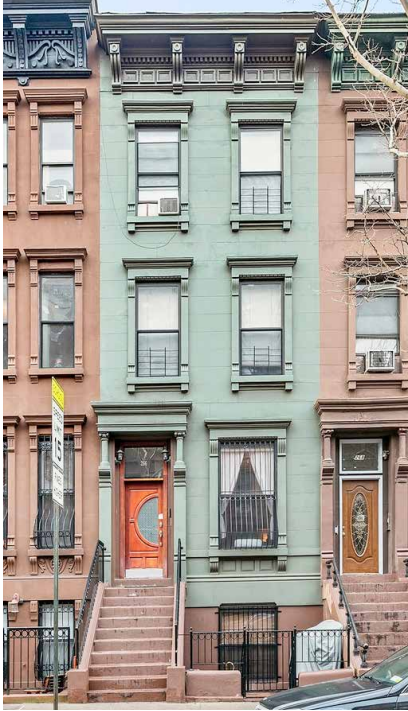
Halstead.com WEB# 19432409

Generally North of 96th Street on the East Side, and 110th Street on the West Side