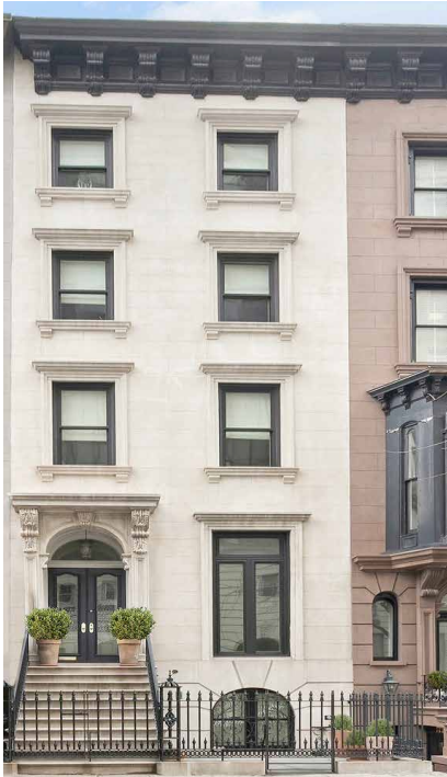
Halstead.com WEB# 19461493