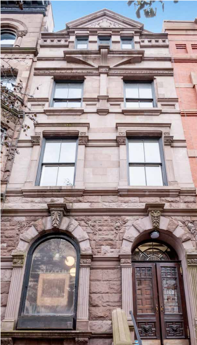
Halstead.com WEB# 19272215

Generally 59th to 110th Street, Hudson River to West of Fifth Avenue