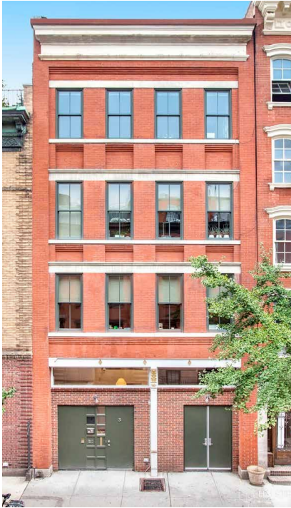
Halstead.com WEB# 18923067