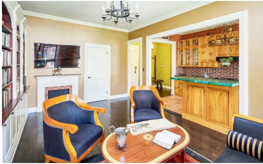
halstead.com WEB# 19668343

Closings were unchanged from a year ago.