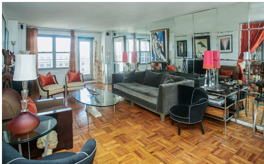
halstead.com WEB# 18741131

The market was more active than last year's third quarter, with 20% more closings reported.