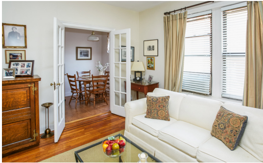
halstead.com WEB# 19378570

Nine percent fewer closings were reported than a year ago.