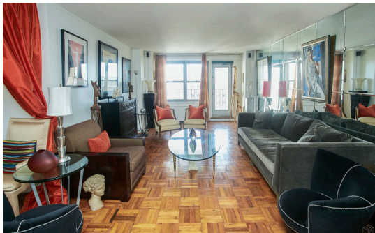
halstead.com WEB# 18741131